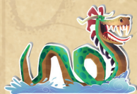
1 Sea monster with standee