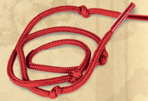
1 Rope with knots