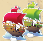
12 Ships with standees