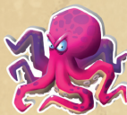
1 Kraken tile

Setup: Place the kraken under the central mountain.